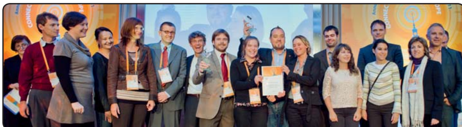
The Best Practice winners