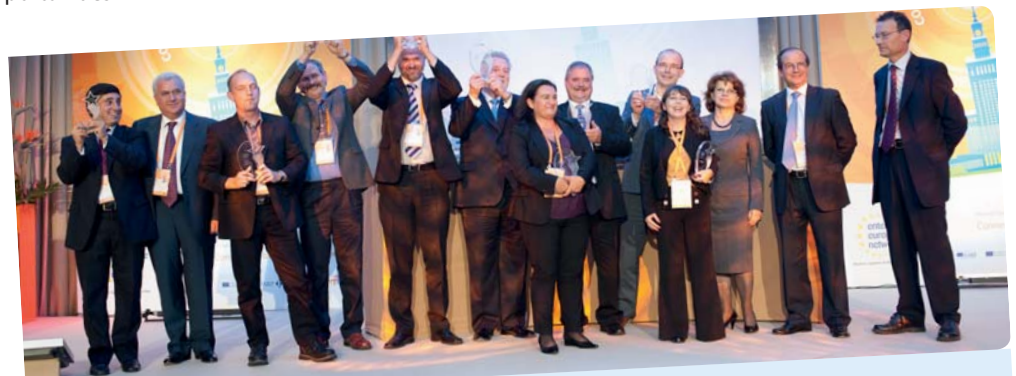
The Network Stars Awards winners at the Annual Conference