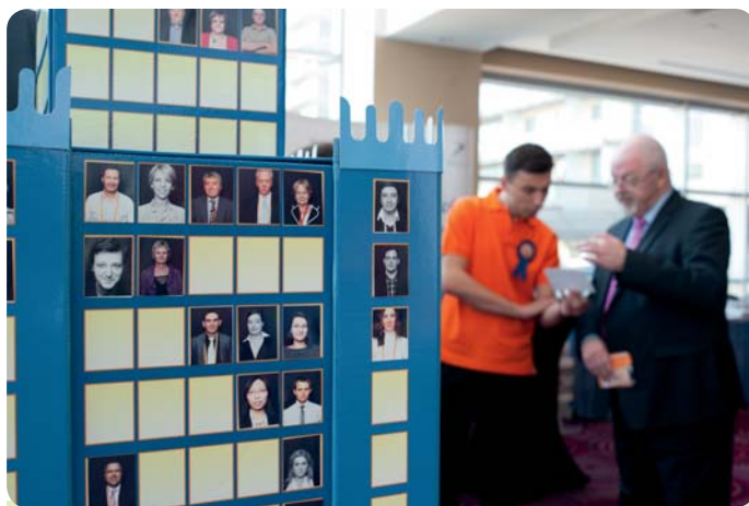
The many faces of the Annual Conference