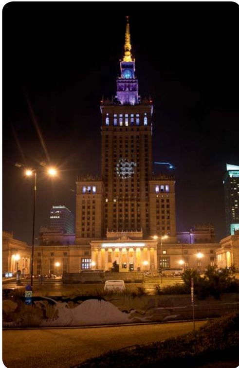
Palace of Culture, Warsaw

Poland's economic boom is fuelling greater demand for the Enterprise Europe Network's services